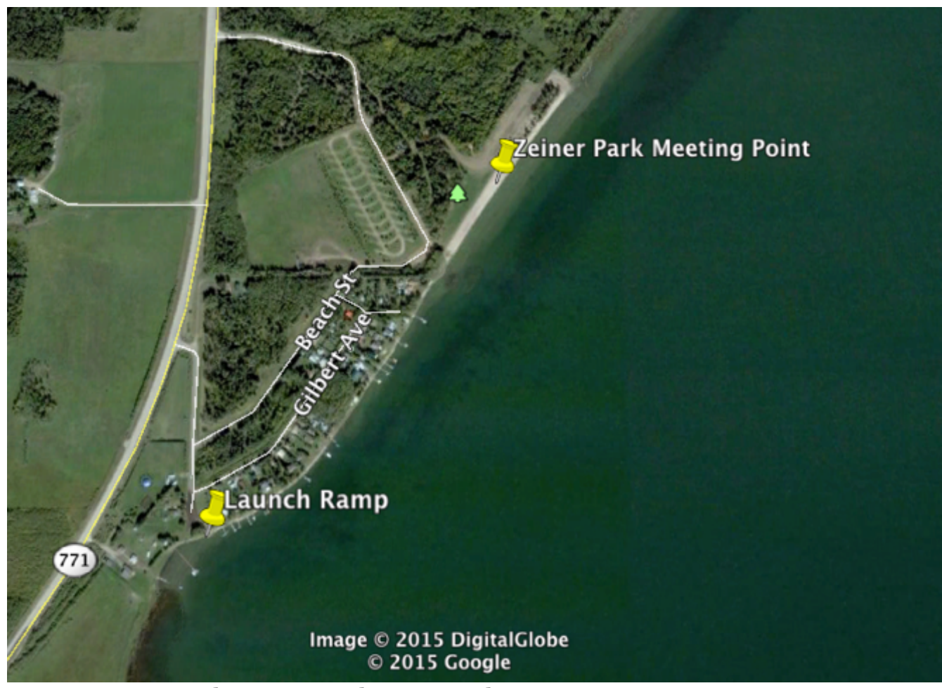
Figure 3: Zeiner Park Camping and Boat Launch