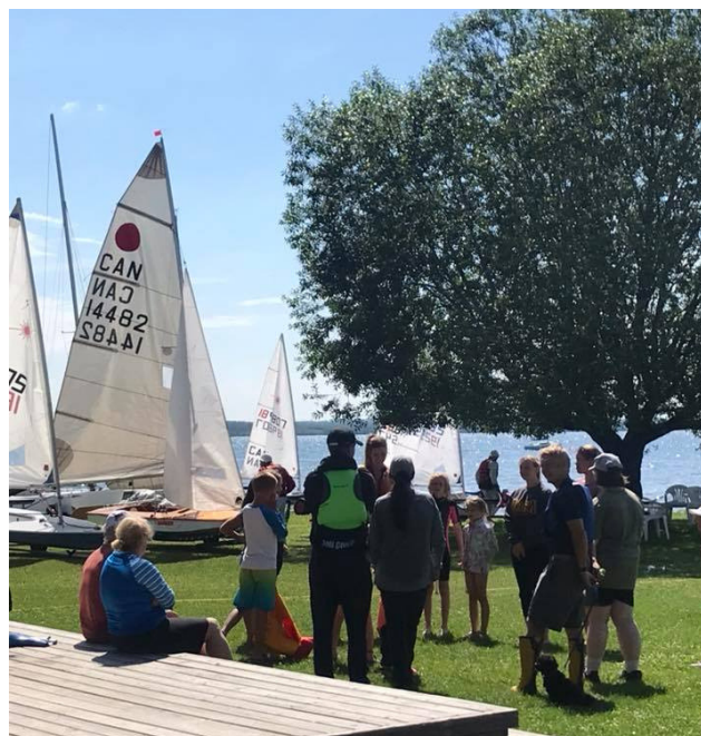
Jr Sailing at WSC